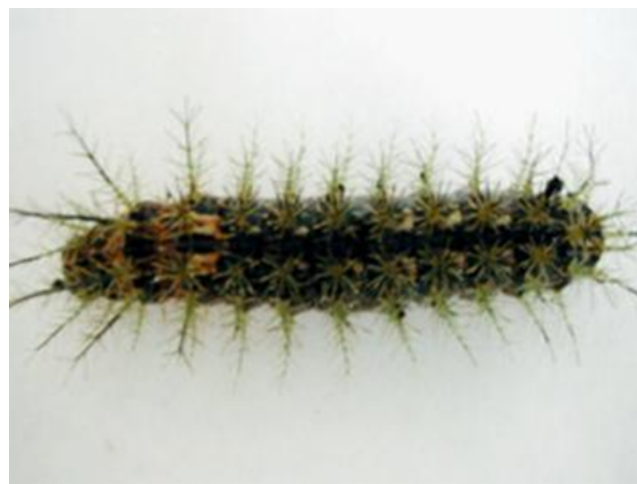
Figure 1 Image of a specimen of Lonomia obliqua , demonstrating the numerous distinct bristles that are usually the first parts of the caterpillar to come in contact with the patient and from which the toxin is liberated.

Keywords: Epidural hematoma; Lonomia Obliqua ; Anti-lonomic serum antidote