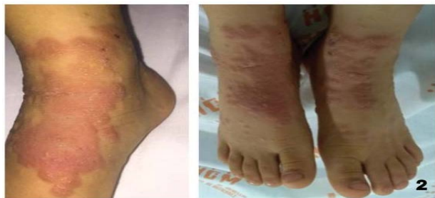
Figure 2 Erythematous plaques with irregular, well-defined borders with some vesicles and scaling on their surface distributed symmetrically on the dorsum of the feet.