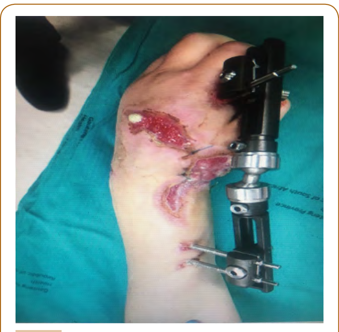
Figure 4 The external fixator was removed.