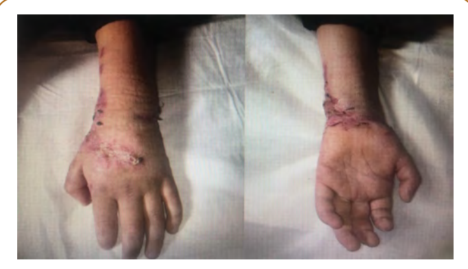
Figure 5The child was seen in the outpatient department and<br/>the wounds were closed and healing well.

Table 1: Oxford muscle strength grading scale.