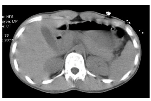
Figure 1 CT image showing normal findings upon admission to the hospital.