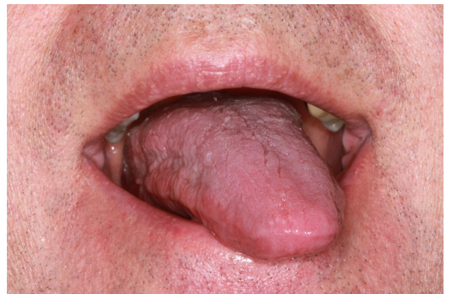
Figure 1 Left side deviation of the tongue on protrusion.

Clinical examination revealed an abnormality of the motor function of the tongue causing left side deviation on protrusion ( Figure 1 ). Sensory function was intact and no other neurological deficits were evident. Following palpation of the left submandibular triangle, a possible mass was detected at level 1b: submandibular nodes, of the neck. Further investigations included further MRI from base of the skull to the clavicle as well as computerised tomography CT scan of thorax and abdomen. These revealed no mass or lymphadenopathy in the neck, however multiple pulmonary nodules and liver lesions, suggestive of widespread metastatic disease were detected.