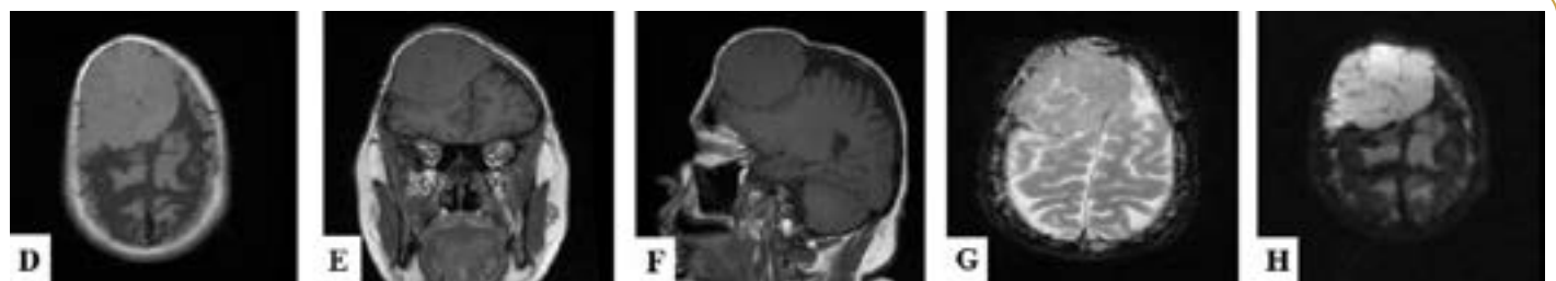
MRI on initial presentation shows a large right frontal calvarial lesion extends intracranially with mass effect on the underlying right frontal lobe, mid line shift and basilar cistern effacement. (D, E and F: T1 weighted image, F and G: T2 weighted image, H: diffuse weighted image).