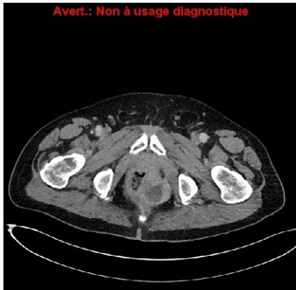
Figure 1 Computed Tomography scan showing a left lateral heterogeneous mass.