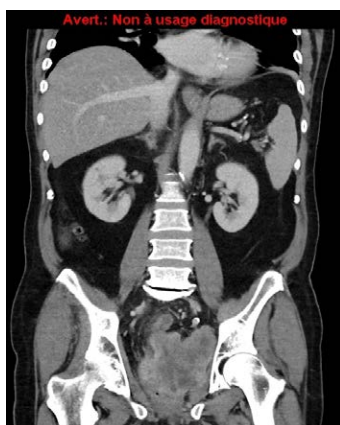
Figure 3 The mass invaded the pelvis.

On the basis of these results, the tumor was classified as a high-grade (III) pleomorphic undifferentiated cell sarcoma, linked to radiotherapy.