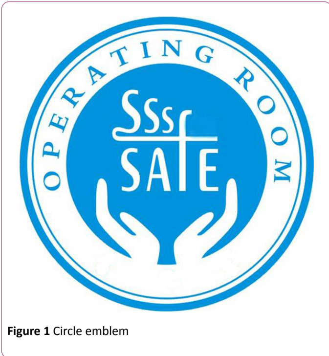
Figure 1 Circle emblem

August to December of 2014, when the QCC method was not applied. The second period was from January 2015 to the end of May 2015 when the QCC method were implemented and managed by the "Safe Circle" team. The deficiencies in surgical instrument traceability were identified and recorded monthly for these two different time periods and a comparative analysis was performed.