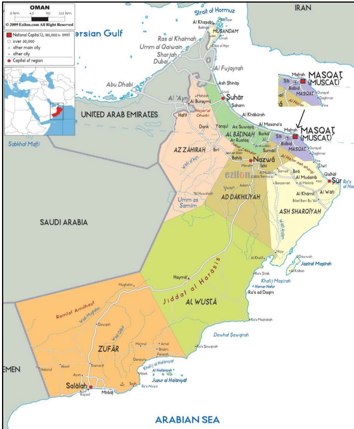
Figure 1. The Study area of Sardinella longiceps in Muscat.