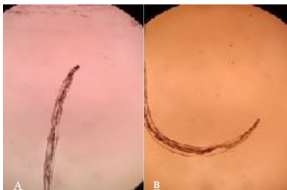
Figure 2 Microscopic identification.

Systemic examination showed no significant finding with no jaundice or hepatosplenomegaly and no cutaneous skin disorder. The blood investigations revealed white blood count was elevated by 15.93 \times 10^3/\text{ul} with also elevated eosinophil count (4.2%), normal hemoglobin of 15.7 g/l, normal red blood cell count of 5.39 \times 10^3/\text{ul} and normal platelet count of 303 \times 10^3/\text{ul} . Urine analysis, Fecal analysis and nocturnal peripheral blood smear for microfilaria were negative. Clinically the diagnose being to intraocular nematode with macular hole.