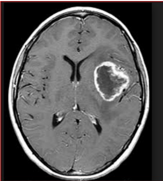
Figure 2 Axial T1-weighted, gadolinium-enhanced MRI of a MPNST.

She was treated by high risk Rhabdomyosarcoma chemotherapy protocol includes: Vincristine 1.5 mg/m 2 , weekly for first 12 weeks and then with each cycle. Actinomycin D 0.045 mg/kg IV push Actinomycin is omitted during radiation therapy. This regimen is typically given for 12–14 cycles lasting 8–10 months. Ifosfamide 2 g/m 2 + Mesna from day 1 to 3. This regimen was prescribed for 10 cycles