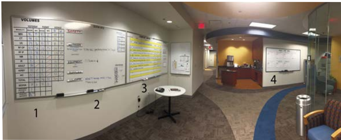
Figure 1 Photograph of DRH space in Radiology. Photograph shows white boards used for volume assessment (1), readiness assessment (2), complex issue tracking (3), and “Walk-the-Wall”.

documents accessible via a web sharing solution combined with a teleconference can also be effective. Although I would emphasize that when possible, in person processes are the most effective. Even for areas that perform DRH in front of a white board, we do keep electronic documents that track our problem solving performance. Also, an electronic summary of each DRH is sent daily in the form of an email to all associates and physicians in a particular area so that even those who are unable to attend the DRH are aware of the issues discussed. It is optimal to have two people to run a DRH. One acts as the verbal facilitator and one as the scribe or data recorder. It is very difficult for one person to play both roles and have the huddle run efficiently. Because the process has a defined structure, the facilitator role can rotate between leaders and staff attendees.