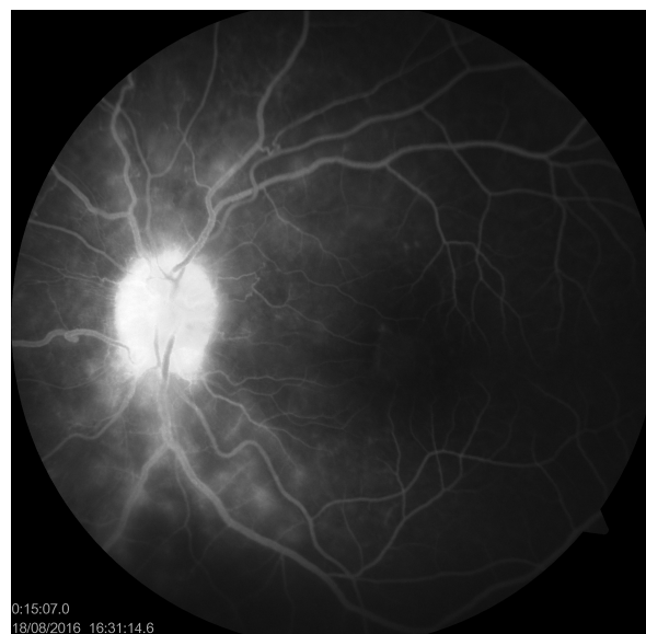
Figure 2 Fundus photograph of the left eye of the same patient in the early venous phase of fluorescein angiography. There are numerous choroiditic lesions seen as subretinal blots in this photograph. The retinal vessels appears intact with no signs of leakages.

Visual acuity when first examined was 6/60 with fundus examination showing gross optic disc swelling with extensive choroiditis forming a perfect radius surrounding the optic disc. A diagnosis of neuroretinitis secondary to Leptospirosis was made and oral Doxycycline was given. Once the infection was under control oral Prednisolone was started to keep retinal inflammation at bay ( Figure 1 and Figure 2 ).