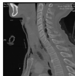
Figure 2 Sagittal CT of the cervical spine with pneumorrhachis.